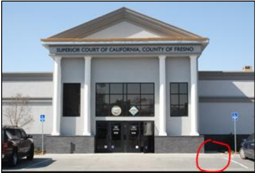
Juvenile Justice Campus – Front steps – Near Sign