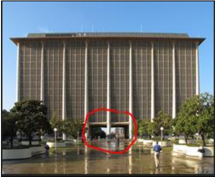
B.F. Sisk Courthouse – Front steps – near exit