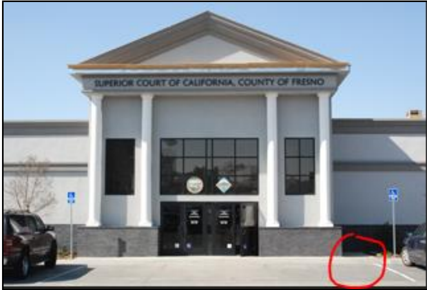
Juvenile Justice Campus – Front steps – Near Sign