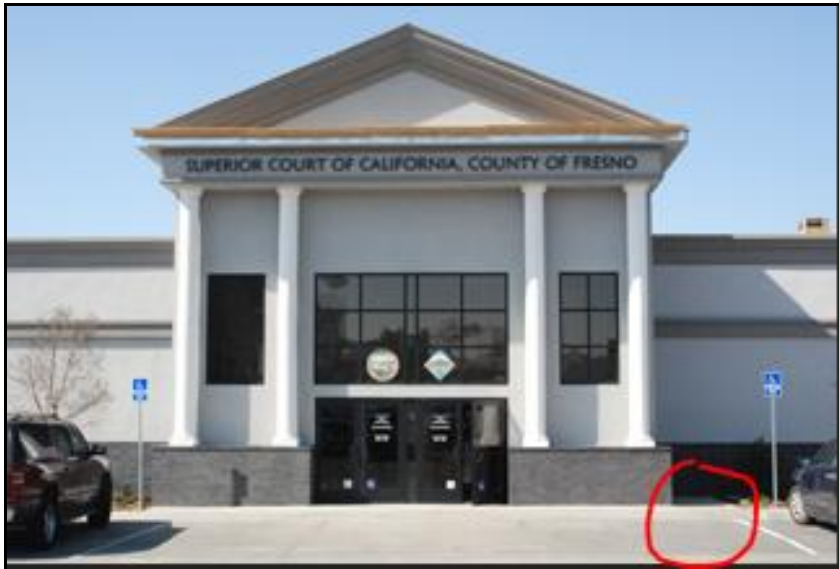
Juvenile Justice Campus – Front steps – Near Sign