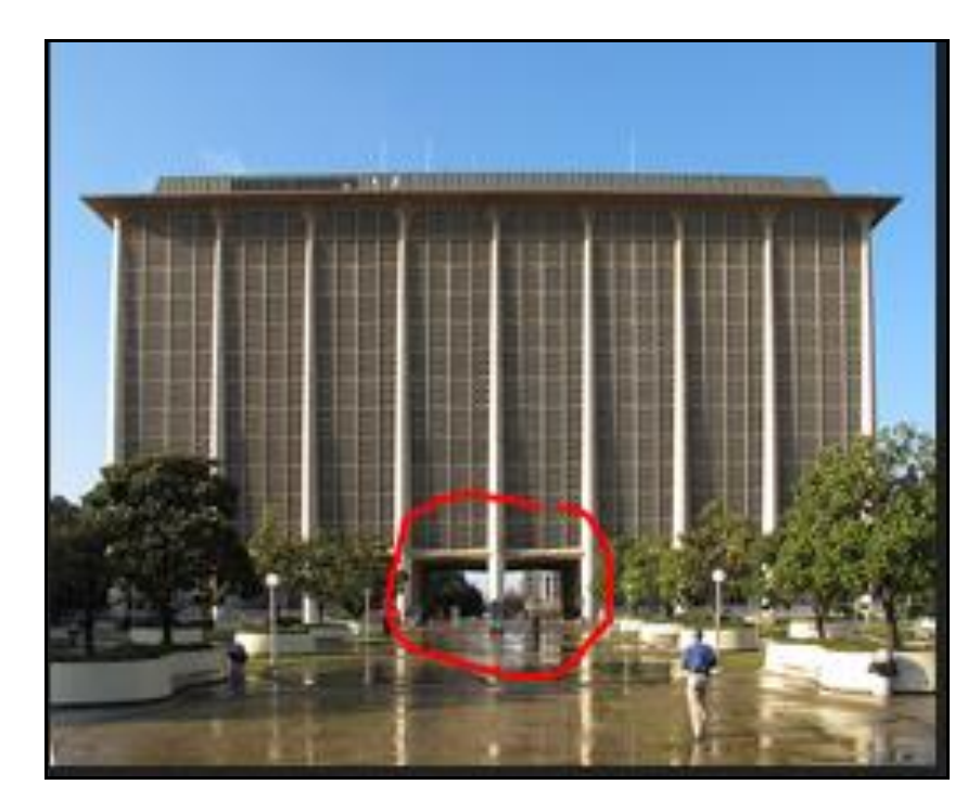
B.F. Sisk Courthouse - Front steps - near exit

Main Courthouse - Breezeway between buildings