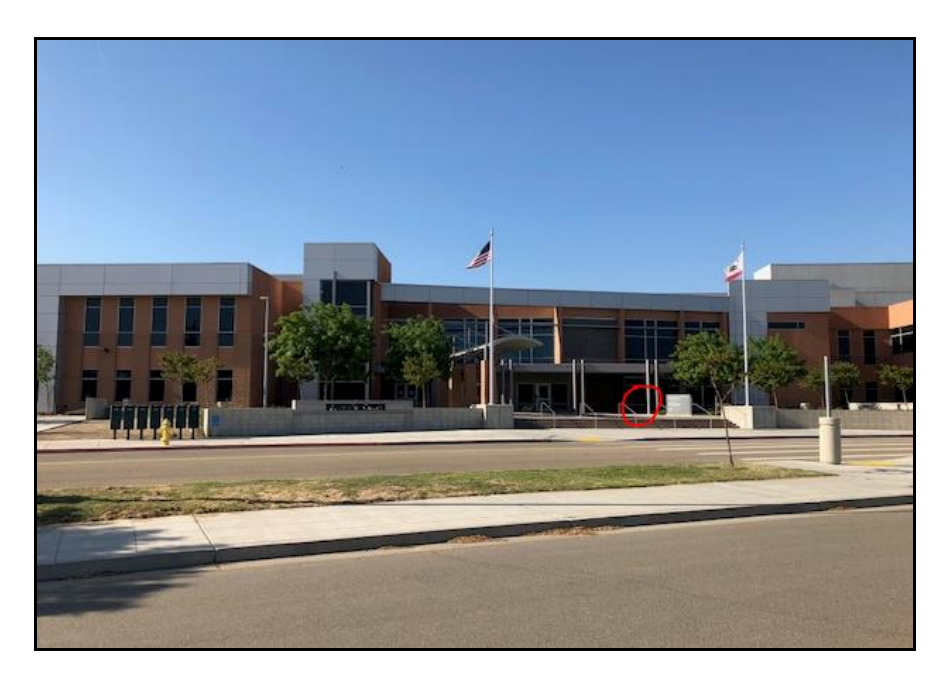
Juvenile Justice Campus – Front steps – Near Sign

Traffic Courthouse – Front area – East Side